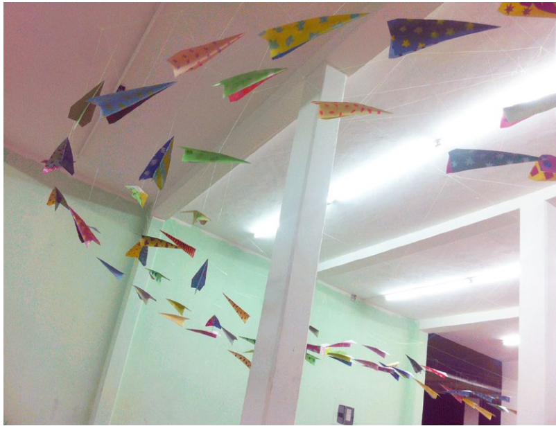
FIAP by World Art Destinations , Cancun Mexico, 2015