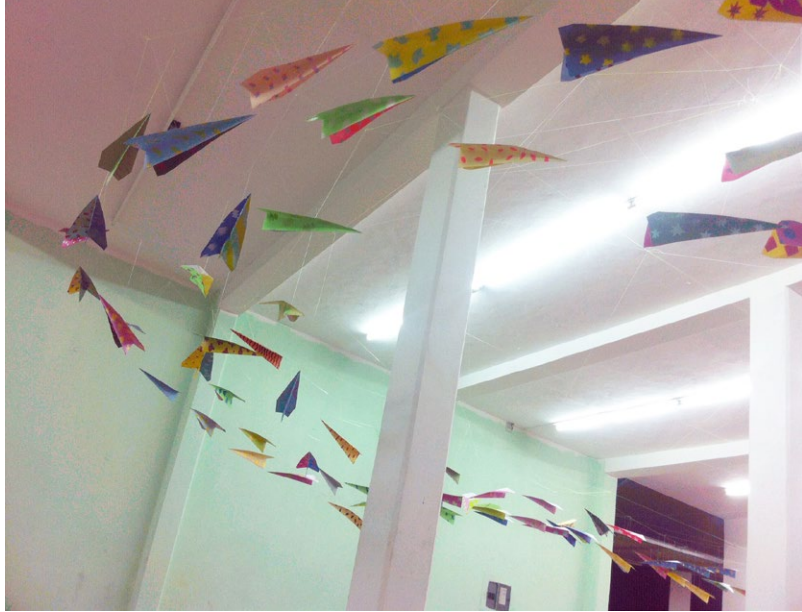
FIAP by World Art Destinations , Cancun Mexico, 2015