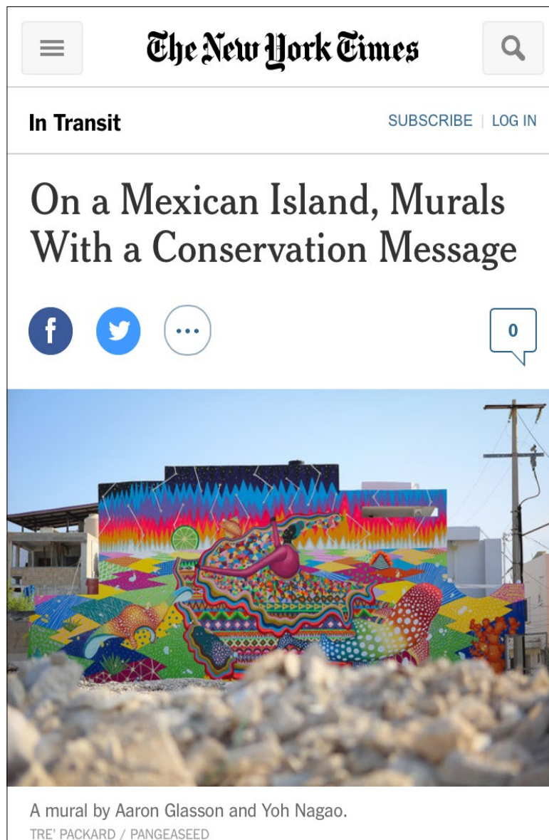
SEA WALLS by PangeaSeed , Isla Mujeres Meixco, 2014 on New York Times NOVEMBER 11, 2014

http://intransit.blogs.nytimes.com/2014/11/11/on-a-mexican-island-murals-with-a-conservation-message/%3F_r%3D1