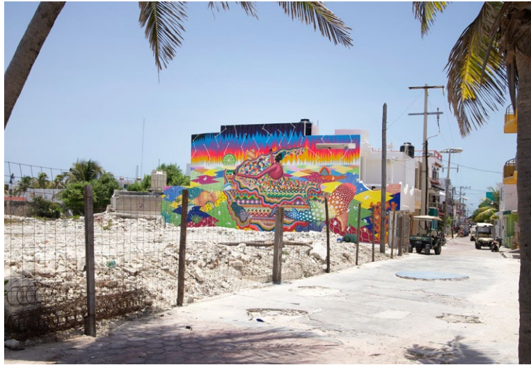
SEA WALLS by PangeaSeed , Isla Mujeres Meixco, 2014